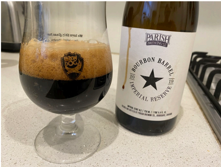
Photo taken by my friend Mark, on his phone, at dinner Wednesday night.

Bourbon barrel Imperial reserve 2019 , 750 mL, \approx 7.8 standard drinks, bourbon barrel imperial stout ale. Parish brewing Co, Broussard, Louisiana, USA.